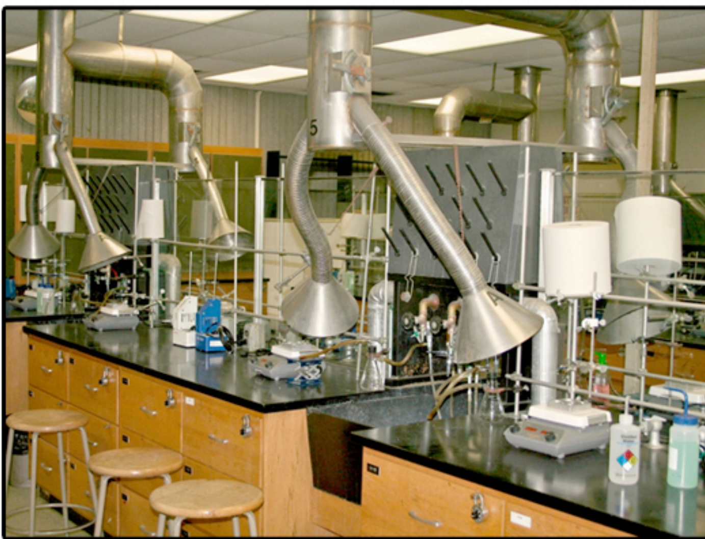
This is a lab currently in use in the Science, Engineering and Math Building.