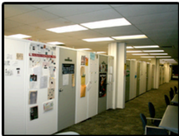
These are faculty offices in the Science, Engineering and Math Division.