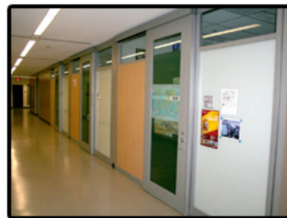
Based on the remodel of the Humanities Building, this is what could be if SEM and Fine Arts are renovated.